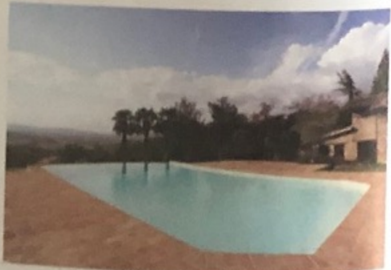
Above: Miataland's infinity pool is a great place to chill and admire the surrounding countryside