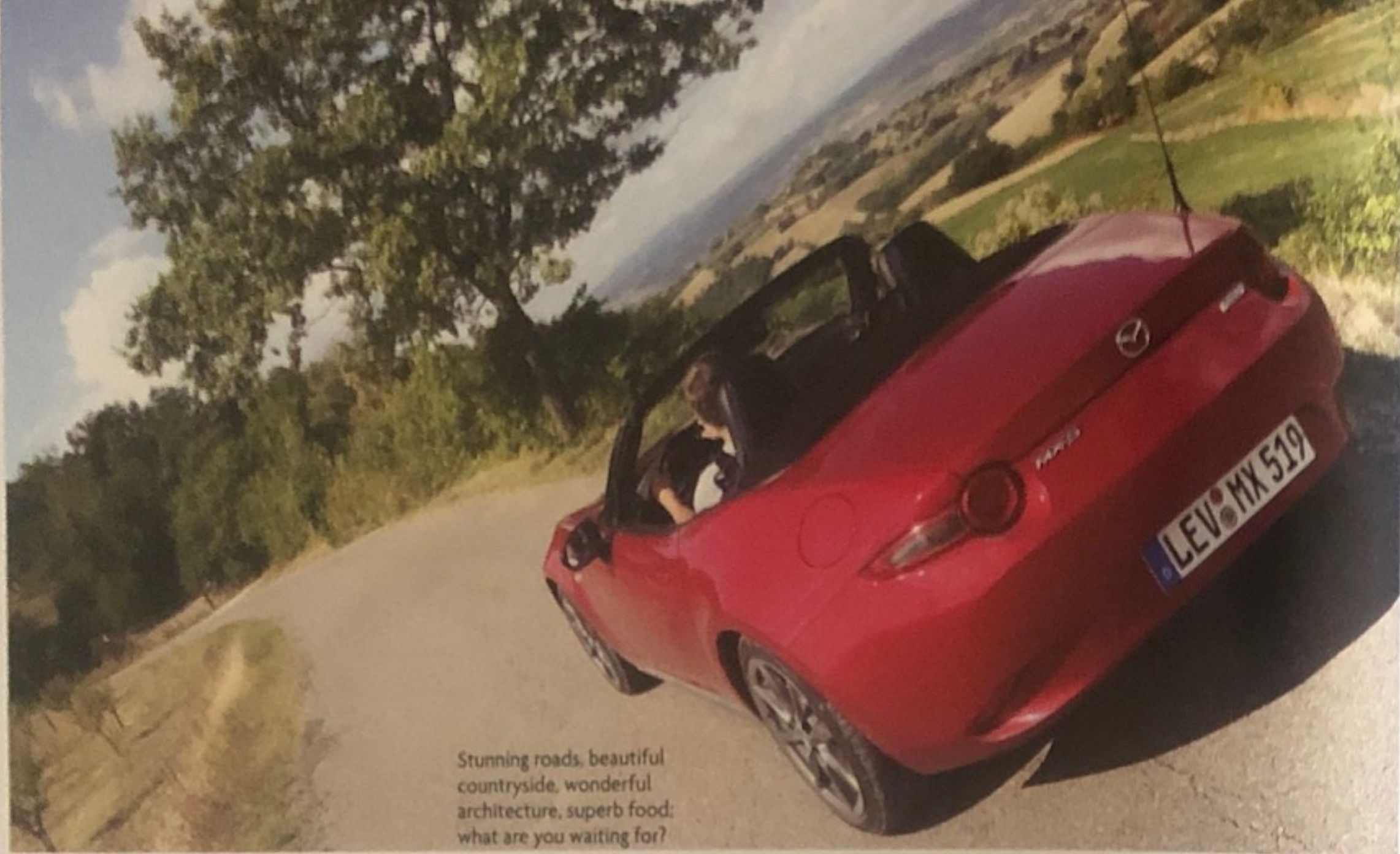
Stunning roads, beautiful countryside, wonderful architecture, superb food: what are you waiting for?

almost as much an advocate for the region as he is for MX-5s.